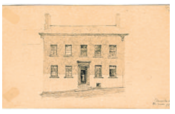
St Barnabas Square, Douglas

His final Douglas connection, the family home at 70 Athol Street, was perhaps on the boundary of the 'contentious' top end of town and the 'supportive' lower town. It was the building he returned to and where, in 1933, he passed away. So, too, has the housenow demolished and replaced by a garden with the second blue plaque.