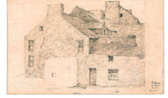
Quine's Corner, 1870

In their details they provide a unique architectural record of buildings existing in the late Victorian and Edwardian period; buildings that are not recorded in the thousands of postcard scenes and photo-