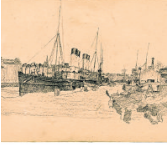
Steam ship and South Quay industry

His artistic skill then led to him enrolling at the Douglas School of Art, which had been founded to 'meet the requirements of those engaged in various trades and profes-