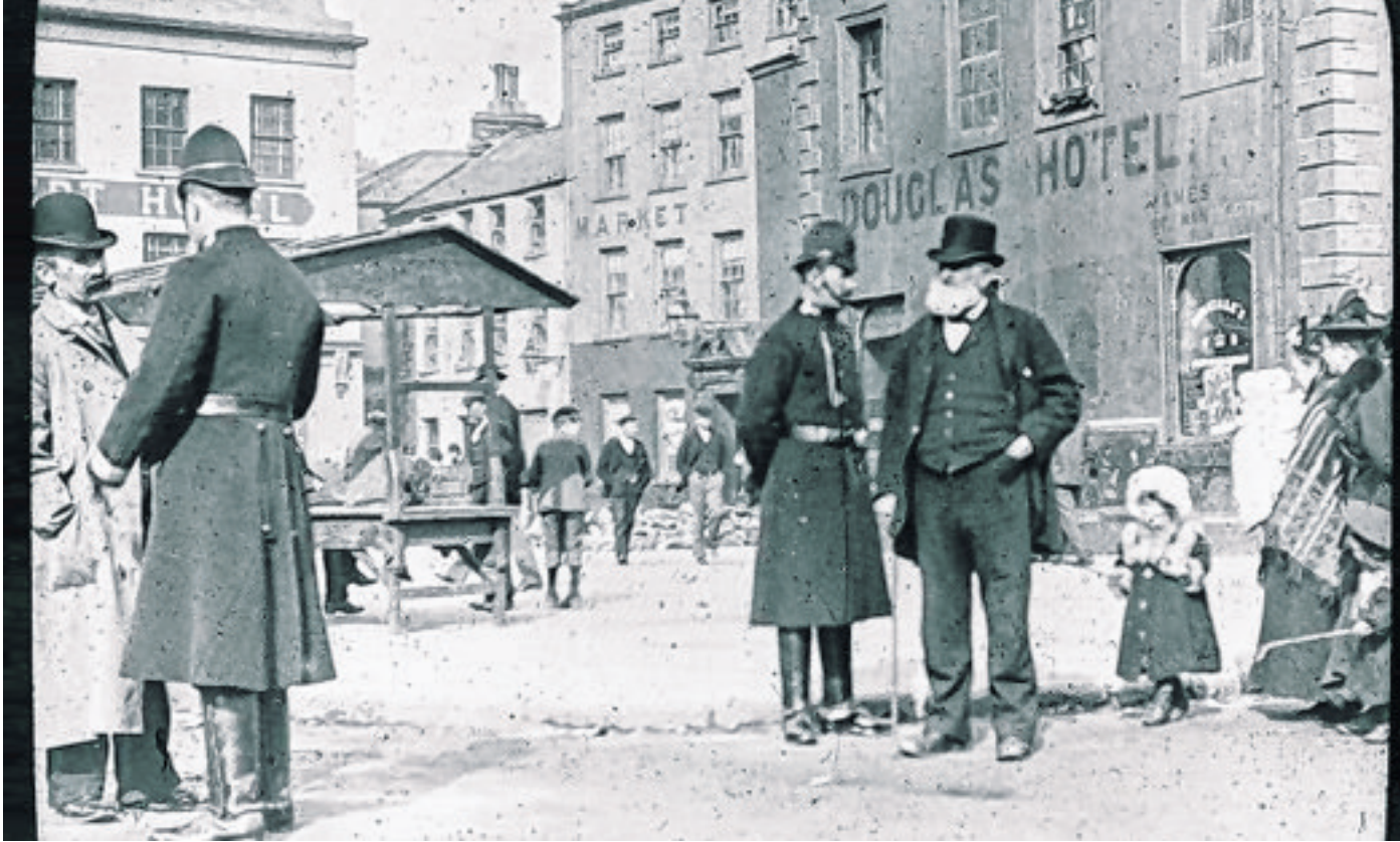
Albert Hotel, rear of North Quay

Such trails could not only identify the localities he knew, but also what current architects and planners might learn from the design of these build-