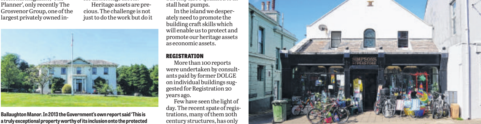
New life - the former Primitive Methodist Chapel in Michael Street, Peel

It is understandable that developers may wish to increase the available floor space by doing it but frequently in a townscape it can be highly undesirable.