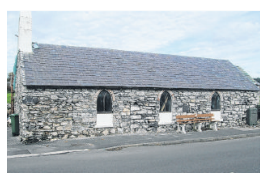
Many useful lives - best known as Colby Chapel, this was: a pub, then three houses, then a hall, latterly a Chapel, and now a house again (not Registered)