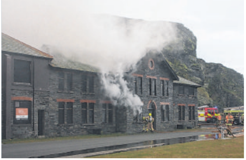
Marine Biological Station – not registered, neglected and now threatened with inappropriate and over-tall redevelopment

materials from or about the site is just ignored.