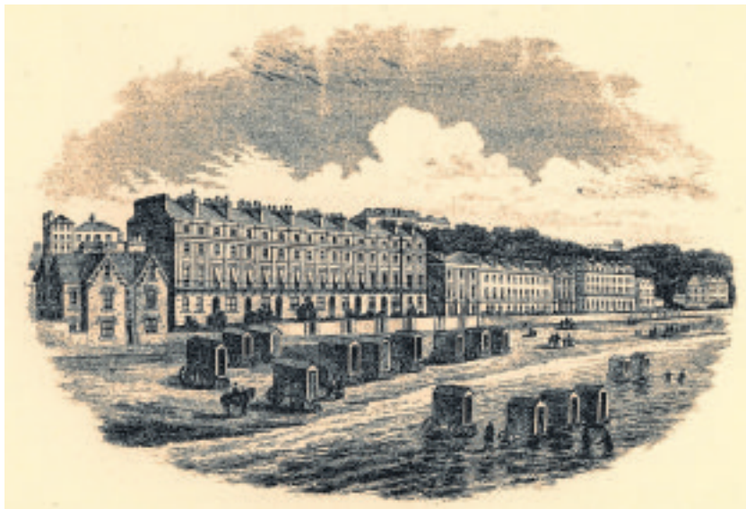
Some of the splendid seafront terraces

The detail of the buildings behind the harbour frontage has been somewhat 'fudged'