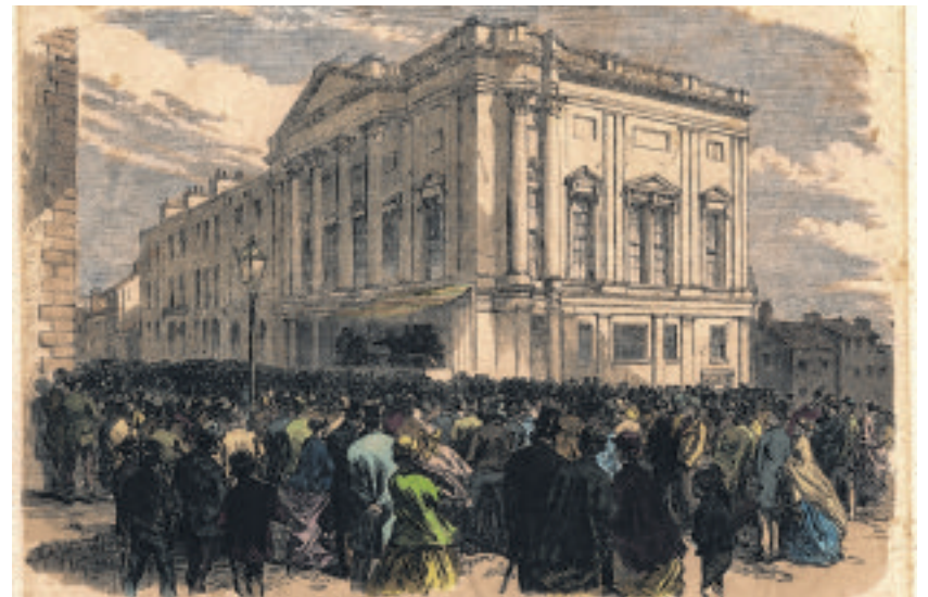
Crowds outside the Athol Street Tynwald Chamber (later Douglas Courthouse) to hear results of the first democratic House of Keys election in 1866