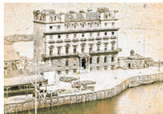
(Above) The Imperial Hotel, with the Steam Packet goods wharf/sheds left and (below) Steam Packet goods wharf and covered loading area