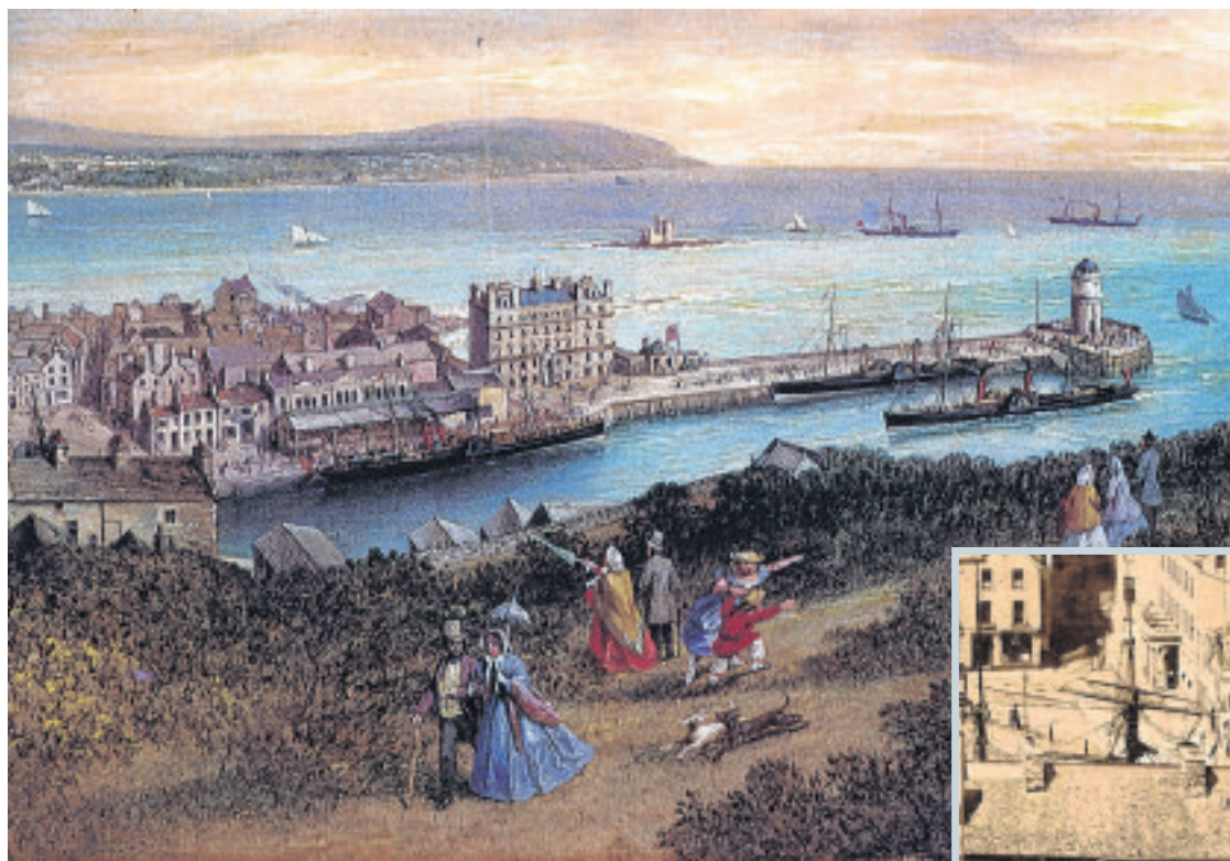
Manx Museum Art Collection