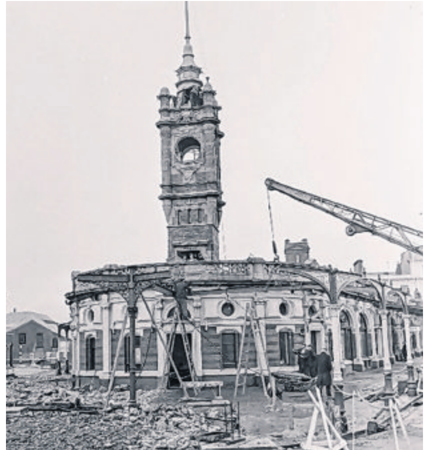
Demolition of the 'triangle building' - what happened to the clock? (iMuseum)

One of those involved in this and who also designed the passenger shelter for the realigned tramlines was Stan Basnett who went on to be the last person to hold the title of 'Surveyor General' of