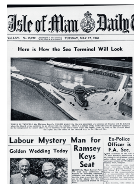
The 'three-legged' design as revealed to the nation in the Isle of Man Daily Times on May 17, 1960. The model, as displayed to Tynwald members, was constructed on four flush-skinned house doors

However, throughout, it remains an important landmark building, which slots into the harbour side landscape well from where you view it.