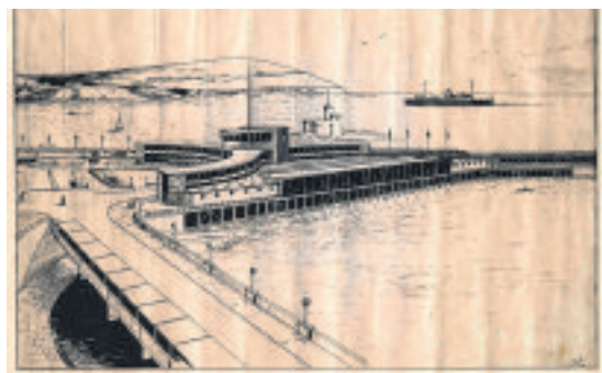
Concept drawings, covered walkway on the foreground, and no 'Roll-off' linkspan