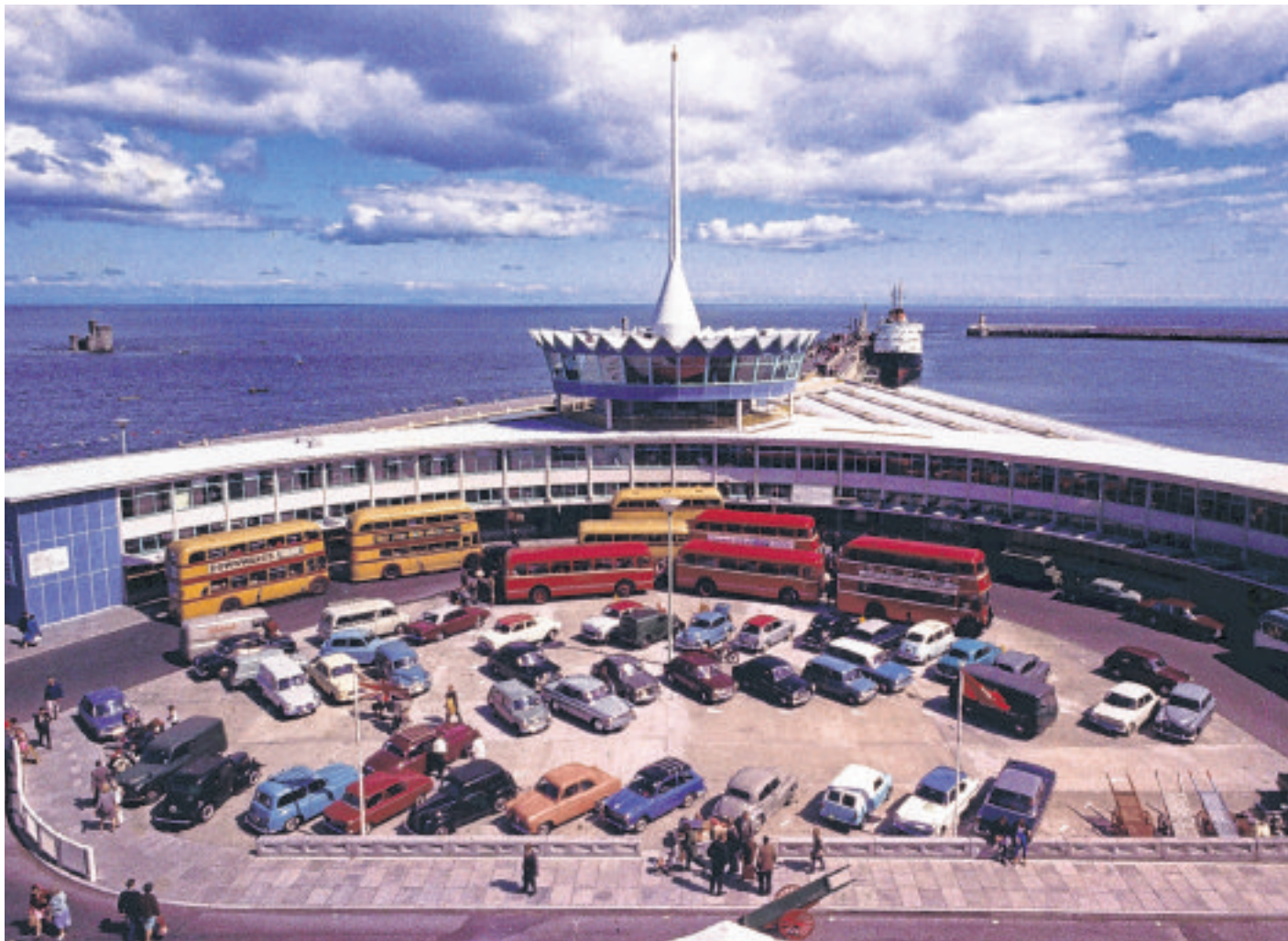
The Sea Terminal officially opened on July 6, 1965

On one occasion a burned-out cargo vessel which had been abandoned off the island was towed into the harbour and lay alongside the Coffee Palace berth for some weeks.