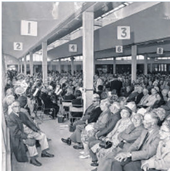
Used by the community, not just ferry passengers - a 1968 Douglas Band concert in the waiting hall