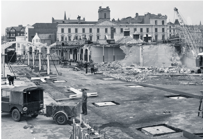
New columns on the left, remains of the 'triangle building' on the right