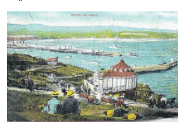
The Camera Obscura is one of only four remaining in the British Isles

Its castellated hexagonal tower was originally a folly. Three sites, two of them registered, of great significance and well maintained with strong boundaries and a strong sense of place. And then a change, the wide open spaces of Douglas Head.