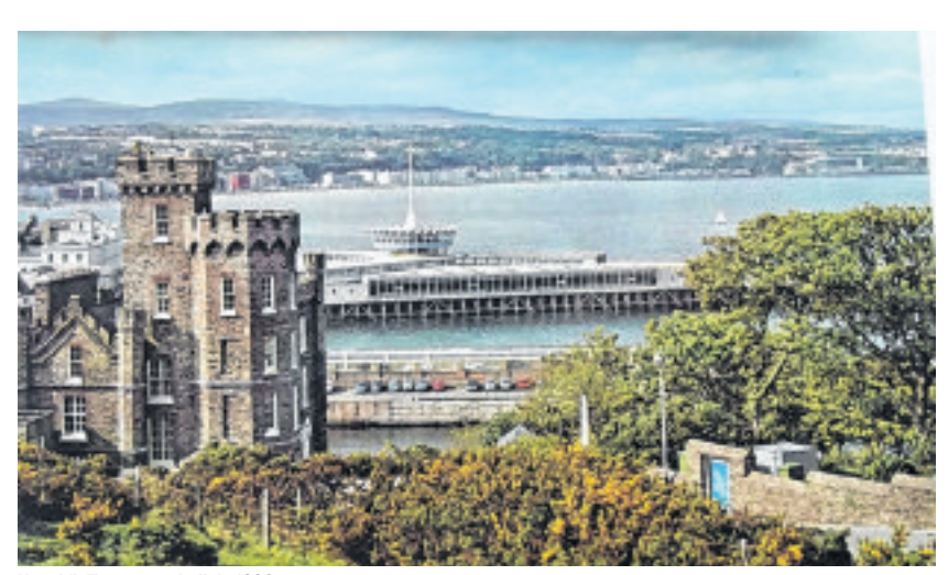
Harold's Tower was built in 1836

Tuesday, June 30, 2020 www.iomtoday.co.im ISLE OF MAN EXAMINER