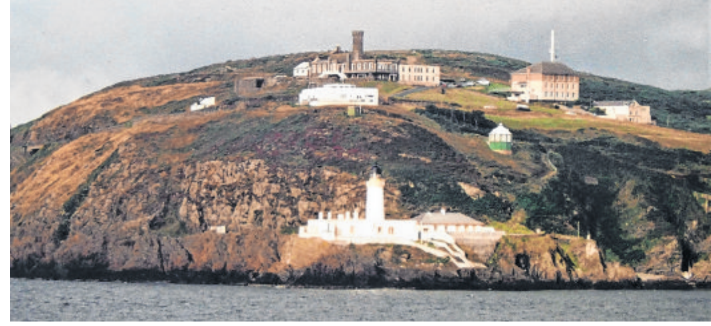
Douglas Head in 1993

South of the harbour the rocky headland with its strategically placed lighthouse gives way to grassy hillside, with a scattering of structures, apartment blocks and aerials, on Head Road large individual properties and terraces and below the working image of tanks and sheds on South Quay. No conservation area is designated.