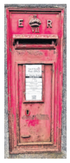
Edward VII letter box located on the Douglas Harbour swing bridge

Linked from 1876 by the unique horse tramway, historically the open promenades developed from the 1860s to 1890s with a mixture of 'terraces' of hotels, boarding houses and individual villas, many now replaced by apartment blocks. It is all a conservation area.