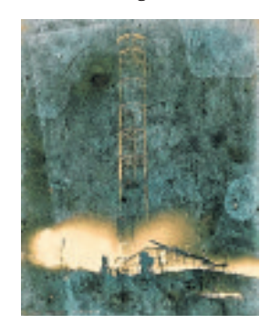
Warwick Tower on fire in 1906

Near to Manx Radio - a small castellated building - a covered well perhaps? On the tower's other side a war memorial. The original Taub-