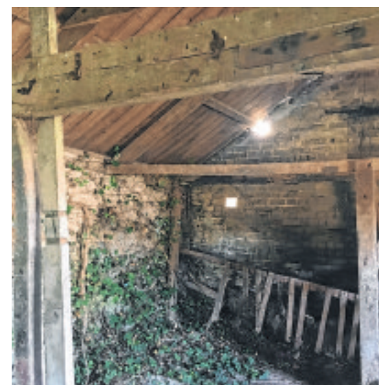
The cattle stall where stock would have been kept