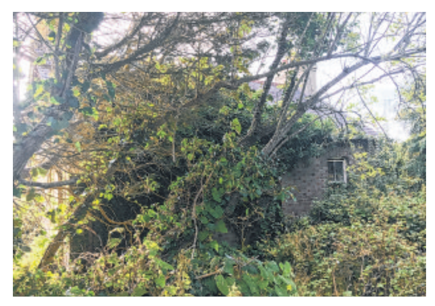
The exterior of James Brew's brick-built Kafue Cottage as it is today