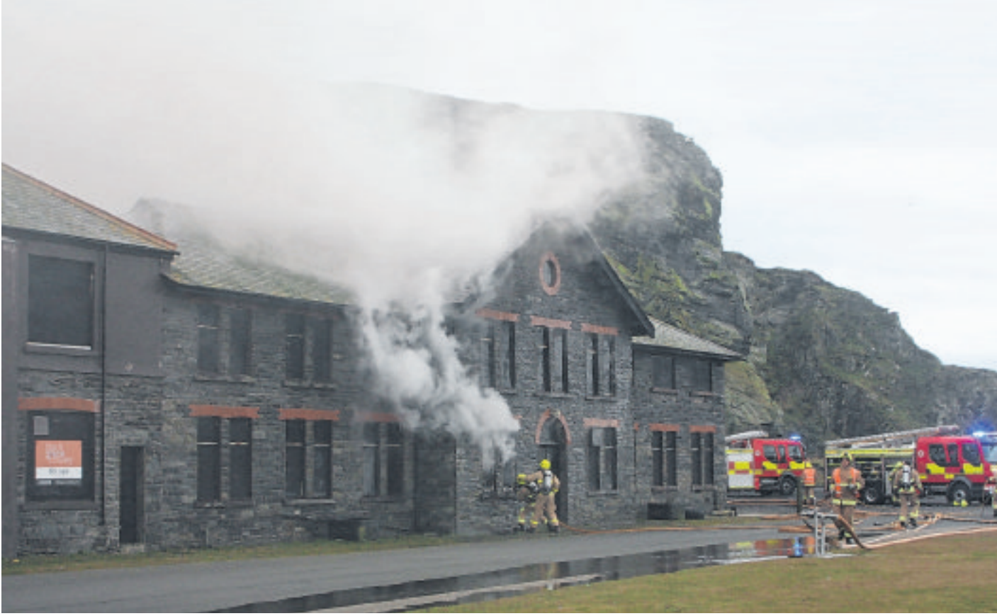
The 1902 Marine Biological Lab falls victim to fire

They considered establishing a station with good transport links and with a hotel or lodging close by to be of 'more use to students and investiga-