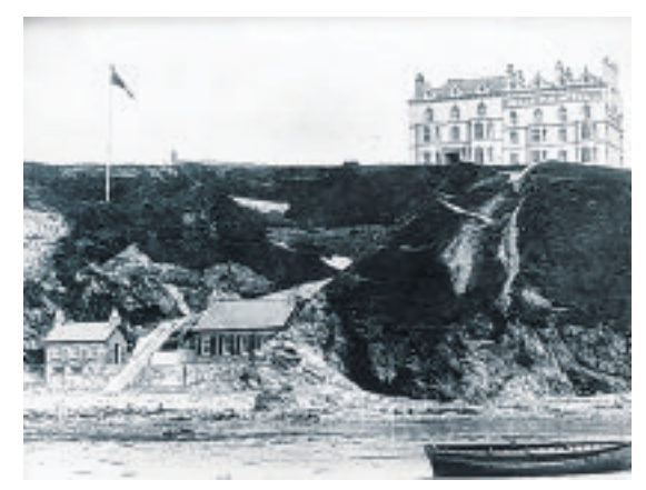
The first dedicated Marine Biological Lab of 1892

The opening of the laboratory was on June 41892 and the list of invitees reads as a who's who of the island at the time, such as Spencer Walpole