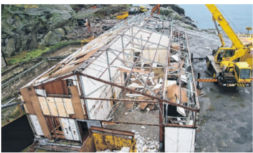
Demolition of the 1963 'white fish' extension in 2006, with spawning ponds visible between the building and cliffs

Tuesday, August 13, 2019 www.iomtoday.co.im