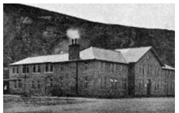
The station c. 1910