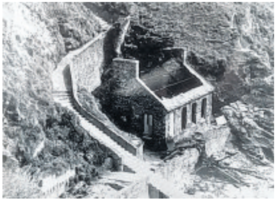
The 1892 Marine Biological Lab after destruction by fire

This first 1892 building served well, albeit a little cramped, until the new Marine Laboratory was built on