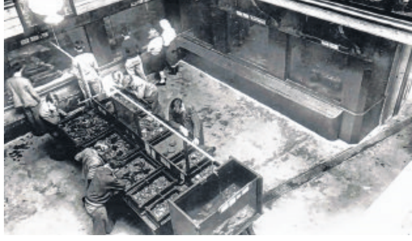
The teaching/public aquarium

The stone is dressed well and in better form than many Manx built random rubble constructed buildings. The layout of the station consisted of a central public aquarium