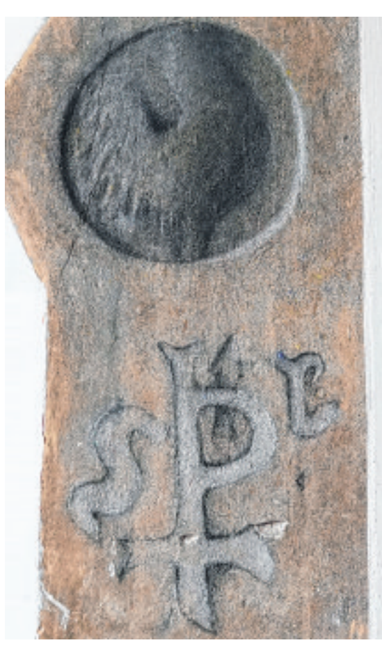
The Cockerel from the story of St Peter, as sketched on the church wall by EH Corbould RI

Tuesday, July 16, 2019 www.iomtoday.co.im ISLE OF MAN EXAMINER