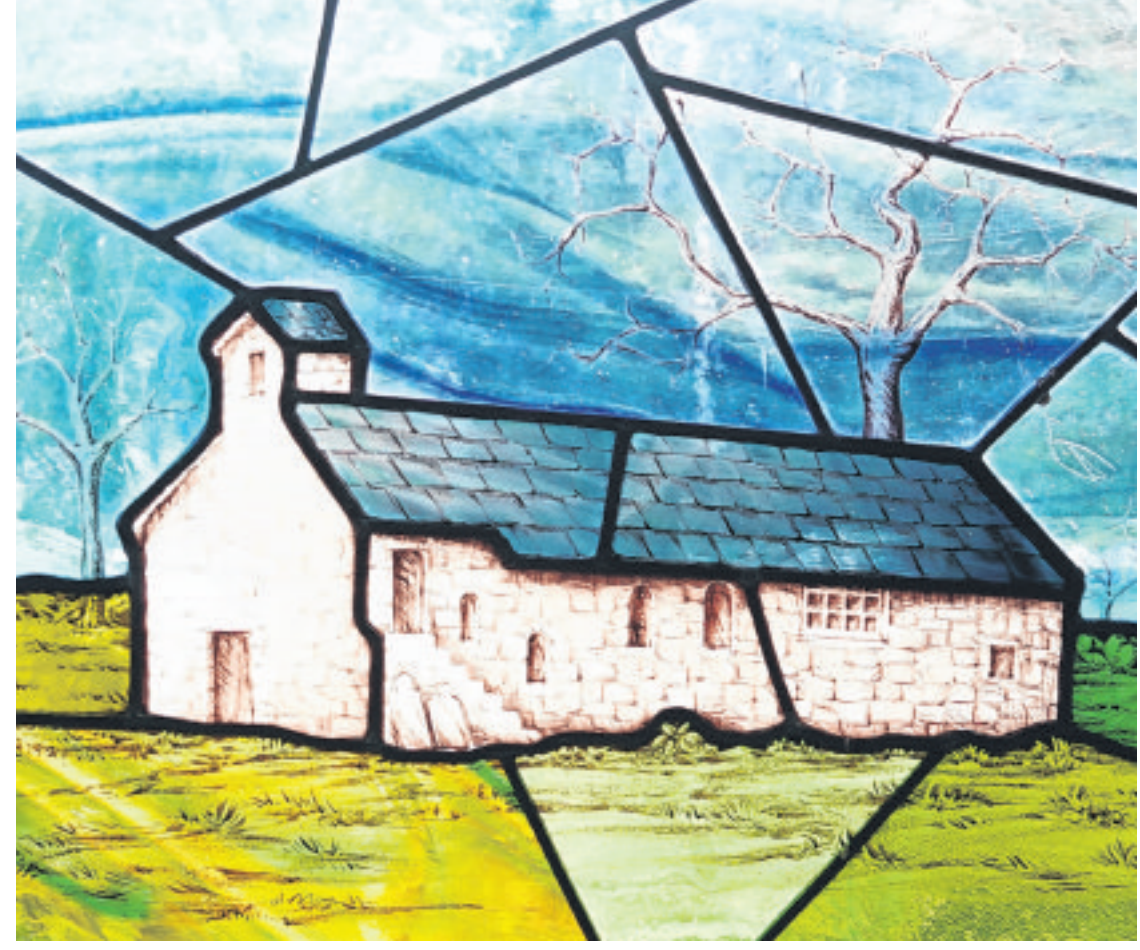
Old St Conchan's church, as portrayed in a stained glass window in St Peter's

Whatever we conject from this information the manorial roll of 1511 shows the Parish, written in Latin, as Parochia Sti Conchani.