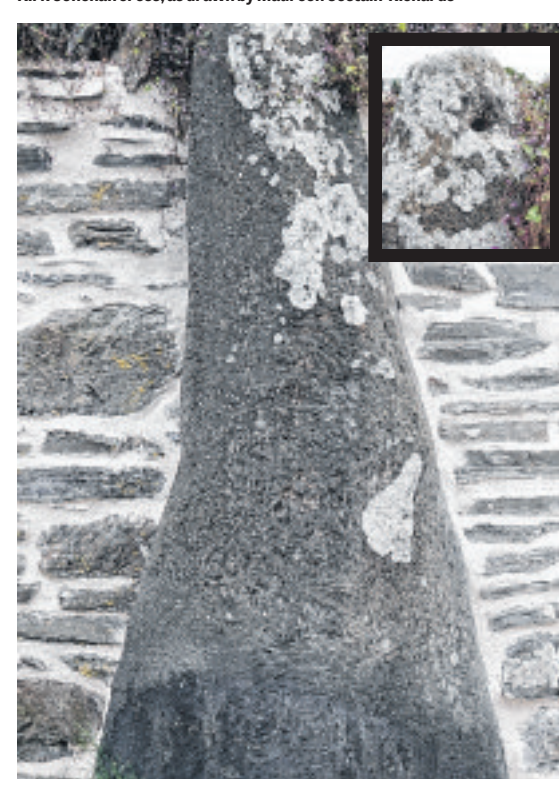
Monolith, once used as a tethering post, and sometimes known as the 'whipping post'