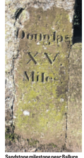
Sandstone milestone near Ballure Bridge

surviving buildings, today's Quayle's Hall has been appropriately renovated by The Rotary Club of Ramsey into the