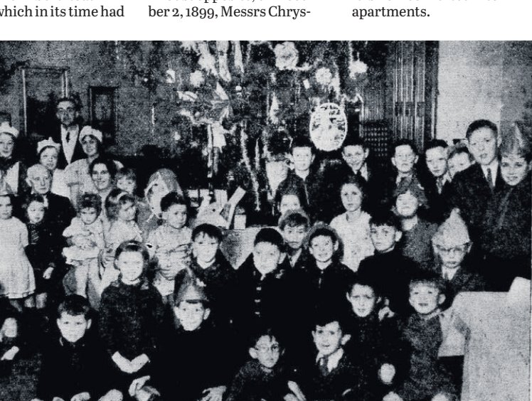
St Maughold's RC School on January 11937

most southerly building, the Albion Hotel, later Ascog Hall, at the junction with Stanley Mount West, was by the late 19th century waiting to accommodate visitors, but was in time used by volunteer army units and Scouts. It is now converted into