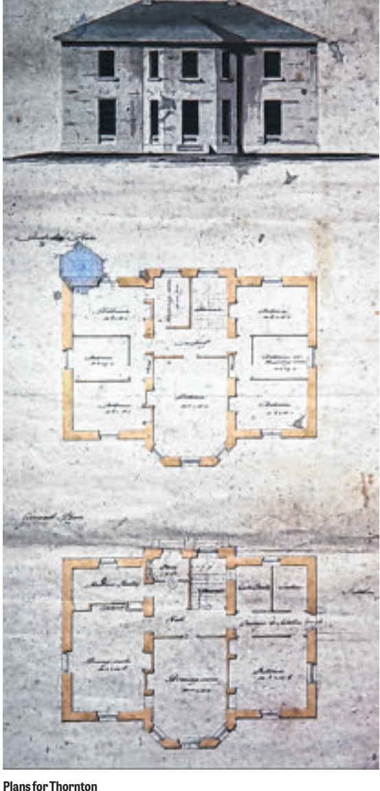
Plans for Thornton

and consecrated in 1781. The design was the prod-