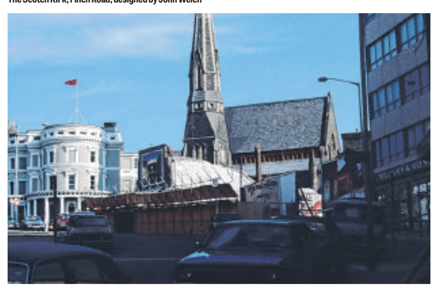
St Andrew's (the 'Scotch Kirk'), in Douglas, just before the main church was demolished to make offices