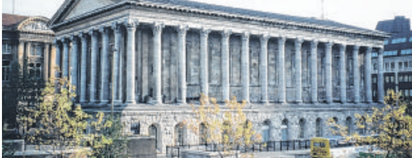
Birmingham Town Hall - designed by Messrs Hansom and Welch