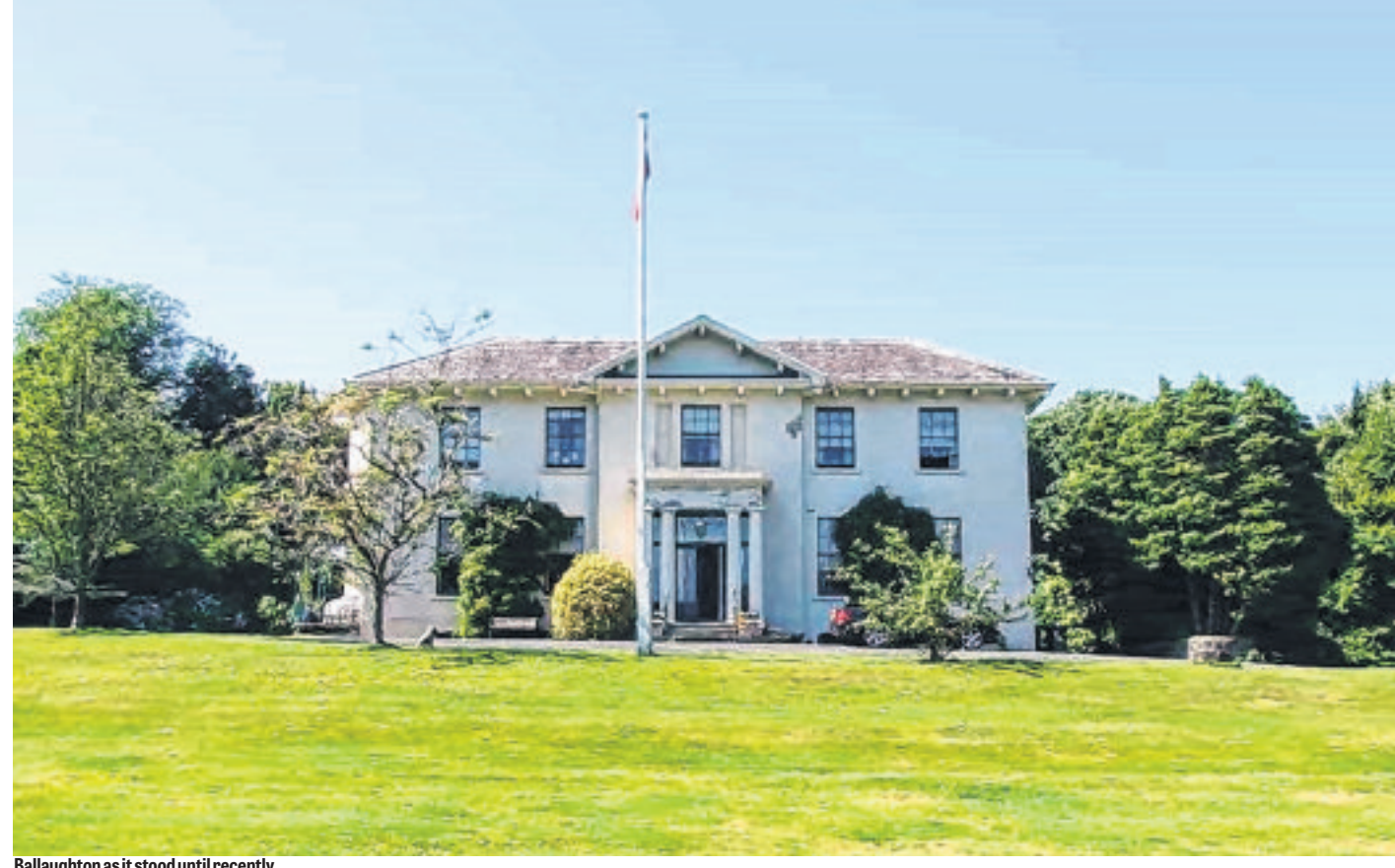
Ballaughton as it stood until recently

This presumably included the site of 'St Helena' (since lost through demolition), which was said to have been used as the 'Kirby' residence