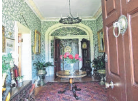
Ballaughton inner hallway

We hope and trust that with the recent recruitment of a registered buildings officer we will not see such tragedies in future.