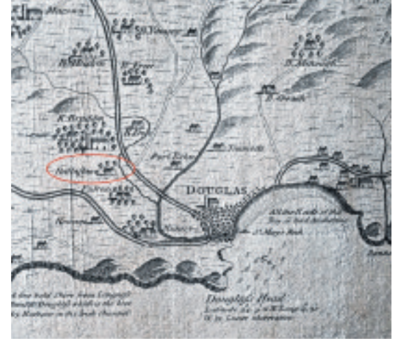
Fannin's 1789 map, showing 'Ballafton' Estate

The report goes on to say that Ballaughton House and grounds should be 'placed on the Registered Building list for its architectural heritage, its