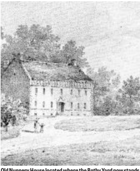
Old Nunnery House located where the Bothy Yard now stands