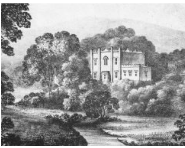
Isabella Goldie's Gothic House in the 1840s after the first extension had been built. The bay window in the centre of the house was matched by one on the rear