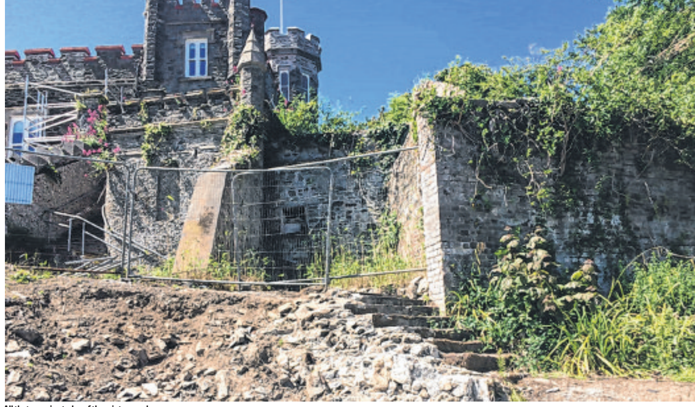
All that remains today of the winter garden

ther for he condemned the house of her childhood and one-time home of the Heywood family. Pinch selected an alternative elevated site within the grounds and then produced plans for a completely new house which was in fact smaller than the old