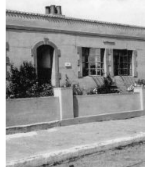
No 1 and 2 Hawthorn Villas on the Castletown Road as built by J C Barry and Sons. Many will recall them in the early 1970s as 'The Sizzler' restaurant before it moved to Onchan