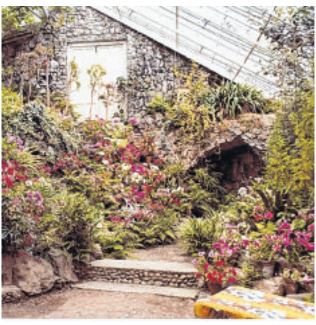
The Winter Garden which led from the dining room to the glass houses and the garden