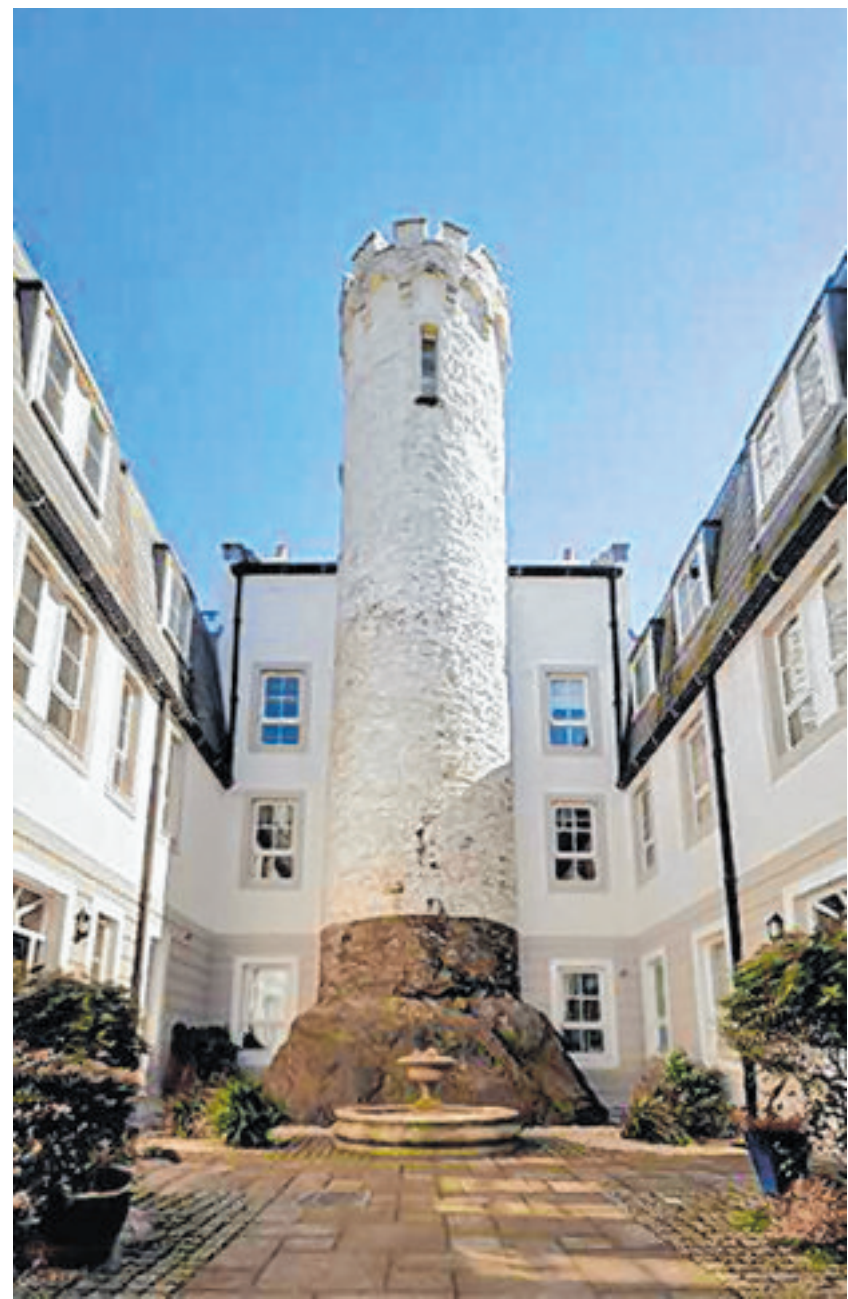
Herring tower Douglas conserved in modern courtyard

Tuesday, May 23, 2017 www.iomtoday.co.im