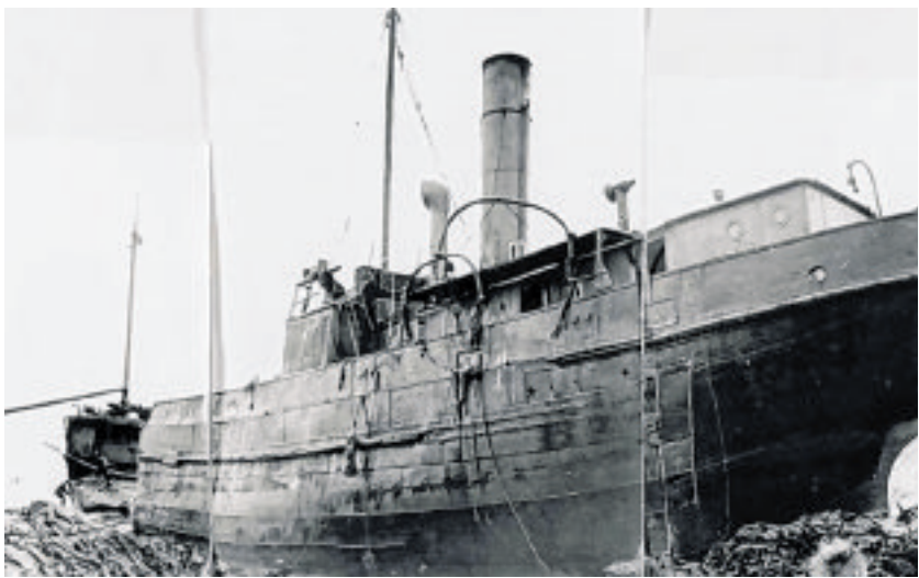
Alyn ashore Langness in 1940

Finished ahead of schedule, the light was shown for the first time in December 1880, and in 1883 the intermittent auxiliary light on the Fort at Derbyhaven was discontinued, and the light-tower within the Fort was removed.