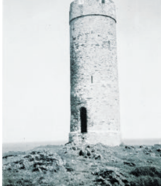
Langness herring tower