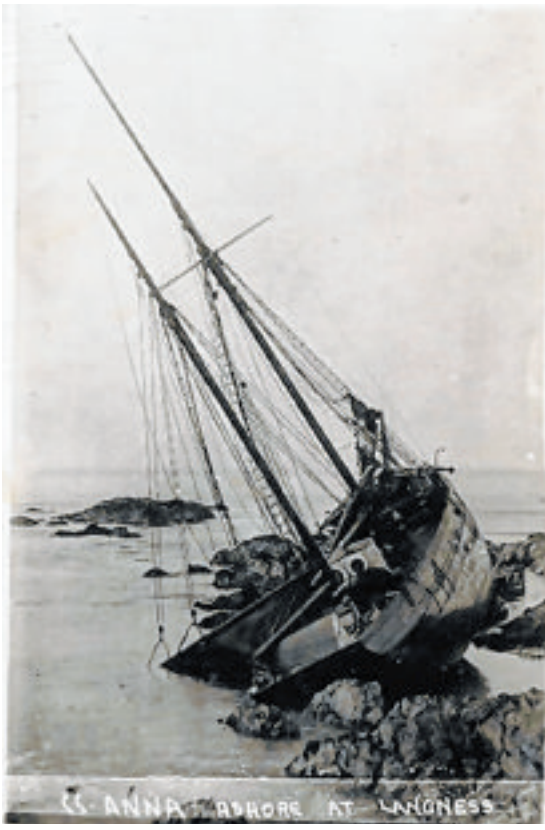
Sailing ship Anna ashore Langness (Manx Museum)

The weather worsened and although five local boats went to assist, only one managed to reach the Racehorse and this boat made several journeys to and from the brig