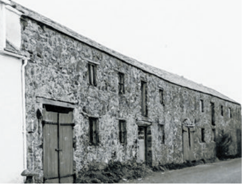
Red-herring warehouse, Derbyhaven - 1981

Seamarks (landmarks designed to be distinctive when viewed from out at sea) and