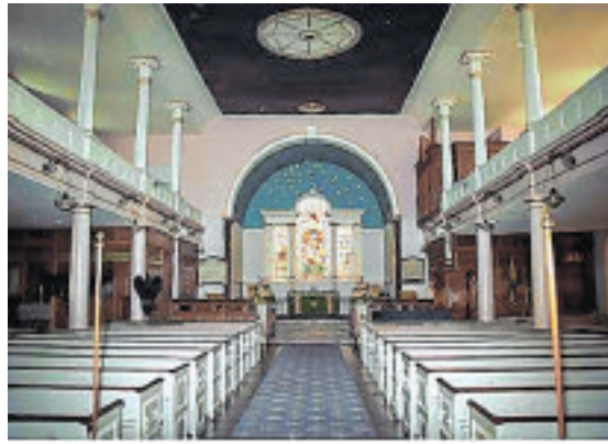
St Mary's Church in Wigton, Cumbria, has clear similarities in design

The interior of St James' Churchin Whitehaven is said to have been the model for St George's. Its Venetian window was blocked up in the 19th century, replaced by a sacred painting taken from Spain in the Napoleonic Wars, but its galleries and pillars remain